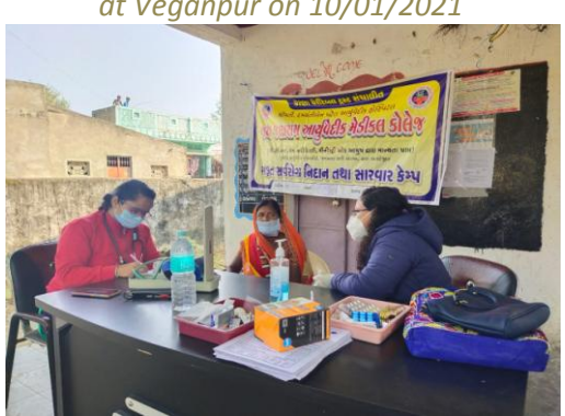
Free Medical Camp at Veganpur on 10/01/2021