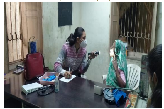
Free Medical Camp at Rampura on 03/01/2021